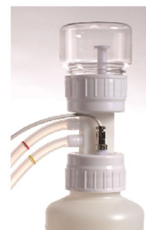
Water mist catching device