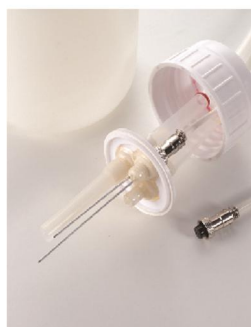
Waste water sensor